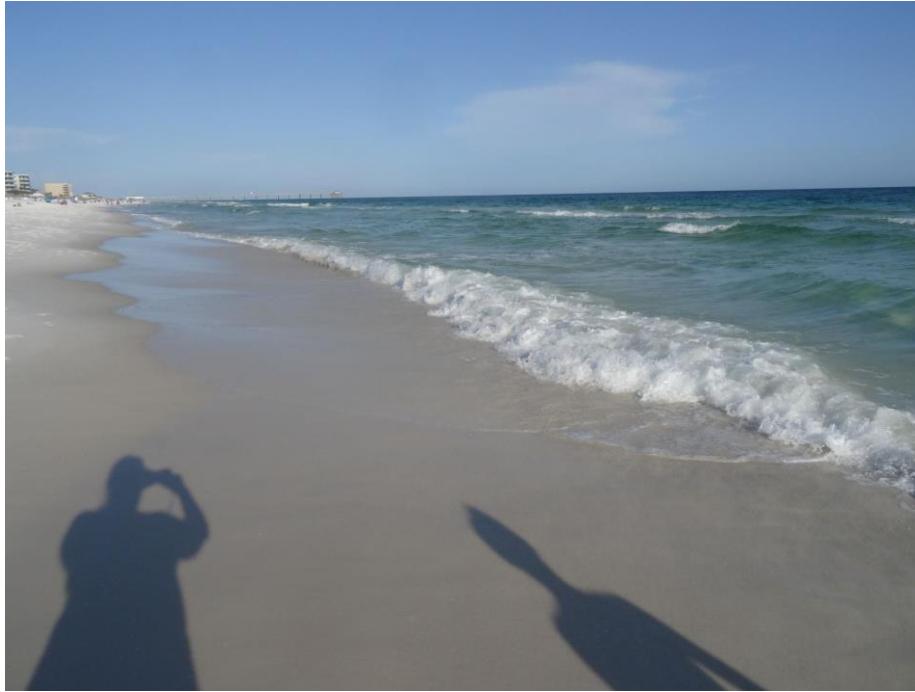
Fort Walton Beach

Well rested we set off again on our 'Coastal Tour' and headed to Fort Walton Beach, FL on US 90/98. We traveled through Biloxi Mississippi, Mobile Alabama and Pensacola Florida with a notable detour on FL-399 to the Gulf Islands National Seashore. The water temp and waves at Fort Walton Beach were just perfect.