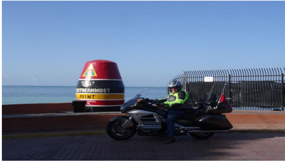
Southern Most Point

Then finally, after 14 days and 4002 miles we were as far from home as we could be and still be in the continental US. WooHoo WooHoo...Ohh wait..We have to drive home.