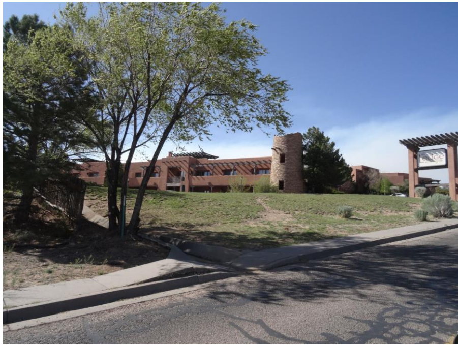
The Lodge at Santa Fe

Well rested we set off to conquer the 'breezy ride' from Santa Fe to Amarillo, TX via US 285 then I-40. We crossed Texas on US 287 from Amarillo to Beaumont with a stop in Waxahachie. The interchanges in Fort Worth were massive. From there we took LA-82 (Gulf Beach Highway) and US-90 to New Orleans. It amazes me how much gorgeous beach was completely deserted.