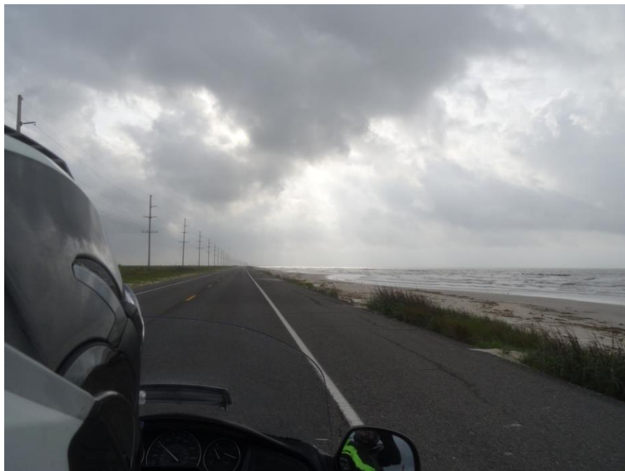
Illustration 1: Gulf Beach Highway

Well rested we set off to conquer the 'breezy ride' from Santa Fe to Amarillo, TX via US 285 then I-40. We crossed Texas on US 287 from Amarillo to Beaumont with a stop in Waxahachie. The interchanges in Fort Worth were massive. From there we took LA-82 (Gulf Beach Highway) and US-90 to New Orleans. It amazes me how much gorgeous beach was completely deserted.