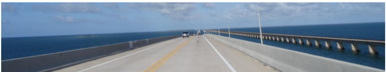
Seven Mile Bridge

When I was planning our last day outbound to Key West I was a bit concerned about being on what appeared to be a 100 mile long bridge with weather reports of scattered thunderstorms. The reality is that most of the ride from Key Largo to Key West is via sandbars(some big enough for a small town and services) with the exception of the Seven Mile Bridge.